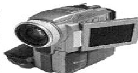
Photo : DCR-PC120E RMT-811