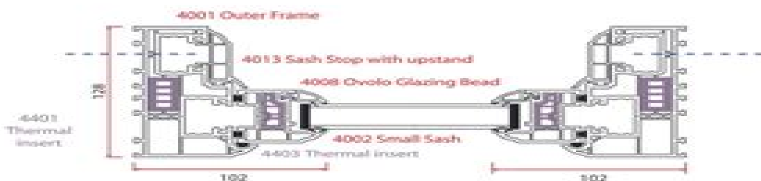
Horizontal section through top sash