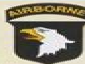
Insigne de la 101st Airborne Div. (Soaring Eagles-Aigles huteurs)