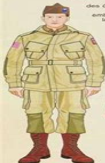
Soldat en tenue de cantonnement.