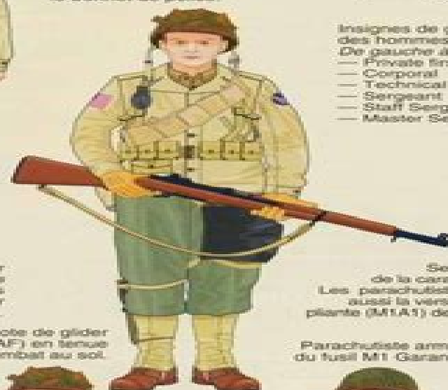
Parachutiste armé du fusil M1 Garand.