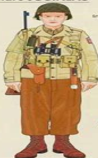
Officier des Glider Troops (troupes embarquées sur les planeurs).