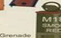
M18 SMOK RED

SOURCES — Guide du collectionneur du 52 AP Engins, Histoire et Collections, 2004 — Les para du « D-Day » - C. Deschamps, L. Rouger, Histoire et Collections, 2004