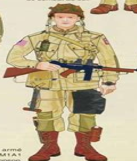
Parachutiste armé du PM M1A1 Thompson