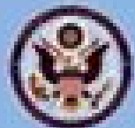
Department of State