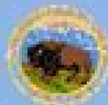
Department of the Interior