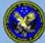
Department of Veterans Affairs