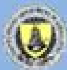
Department of Agriculture