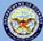
Department of Defense