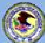
Department of Justice