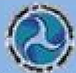
Department of Transportation