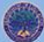
Department of Education