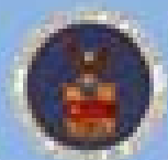
Department of Labor