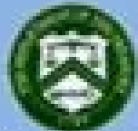
Department of the Treasury