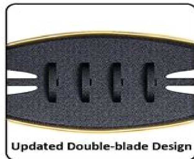
Updated Double-blade Design