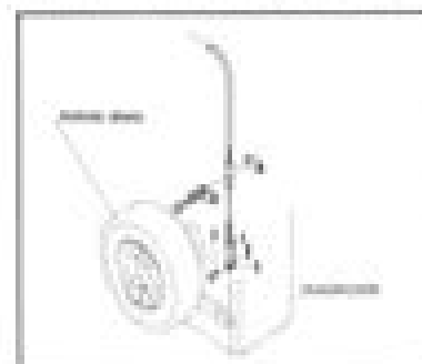
Fig. 15. Adjust Parking Brake Arm