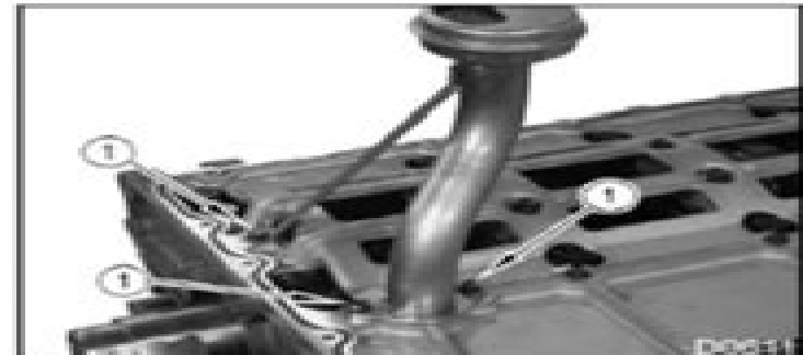
Figure 260 Oil pickup tube