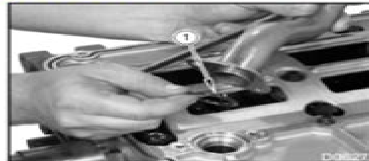
Figure 261 O-ring

Remove the mounting bolts from oil pickup tube.