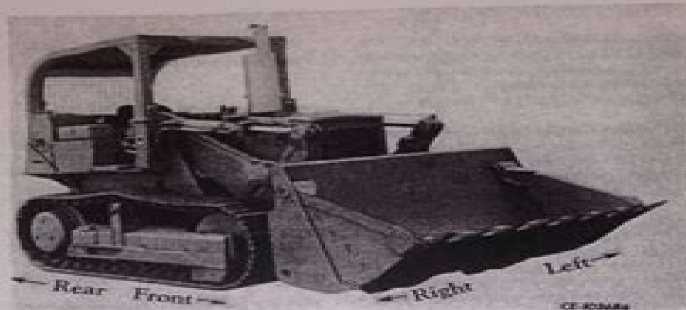
FIG. 1 — Model 175C with Multi-Purpose Bucket