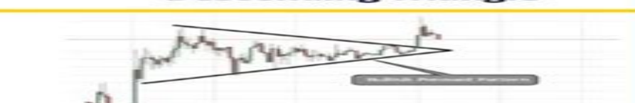
Bullish Pennant Pattern