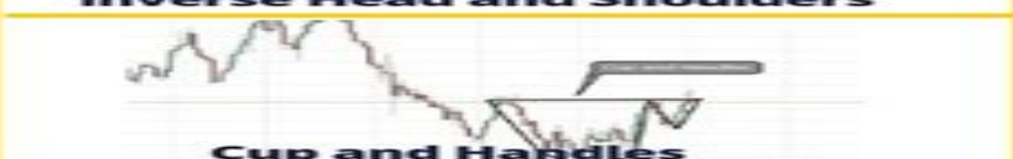
Cup and Handles