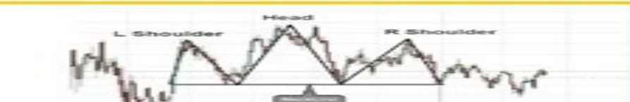
Head and Shoulders