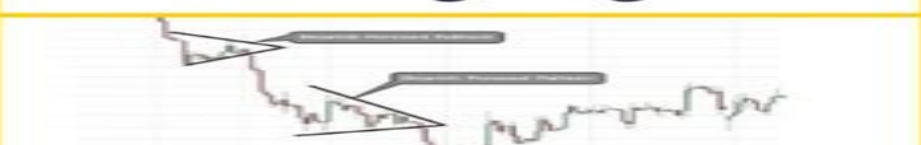
Bearish Pennant Pattern