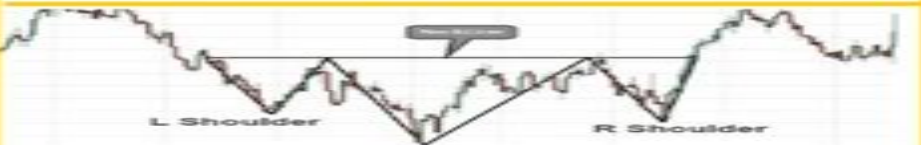
Inverse Head and Shoulders