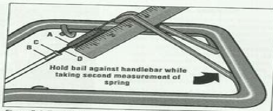
Figure 5-4: To check forward belt tension, take two measurements of the overall length of the coils in the spring – first with the clutch bail open, then with the clutch bail closed against the handlebar.

If the drive belt needs to be replaced, see your local authorized dealer or refer to the Parts List for ordering information. Use only a factory-authorized belt as an "over-the-counter" belt may not perform satisfactorily. The procedure requires average mechanical ability and commonly available tools.