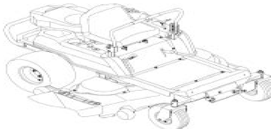
Mustang RZT Riding Tractor

TROY-BILT LLC, P.O. BOX 361131 CLEVELAND, OHIO 44136-0019