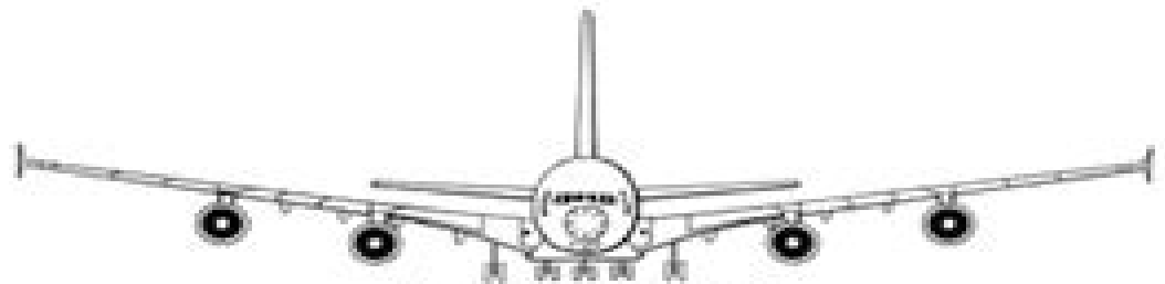
Front view of the A380.