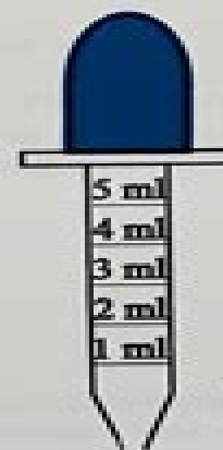
D. Oral Dropper

Answer the following questions 92 through 95 referring to the above devices.