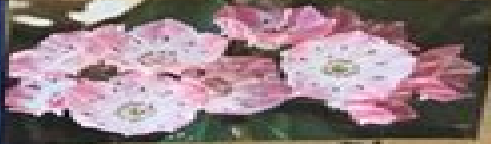
Mountain Laurel State Flower