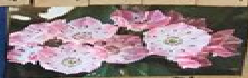
Mountain Laurel State Flower