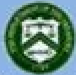
Department of the Treasury