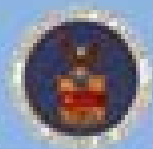
Department of Labor