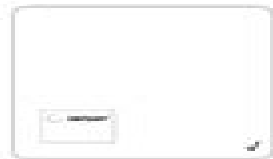
LTE Network Extender