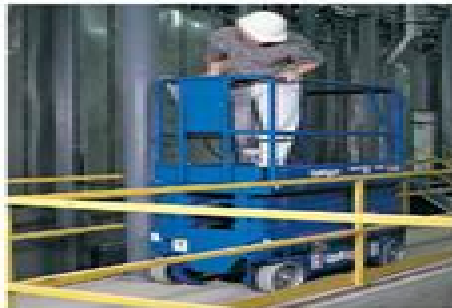
Compact dimensions and tight turning radius provides excellent manoeuvrability

Specifications subject to change without notice. Photos and diagrams in this brochure are for promotional purposes only. Refer to appropriate UpRight operations manual for detailed instructions on the proper use and maintenance.