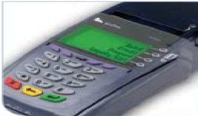
VeriFone® Omni Vx Series