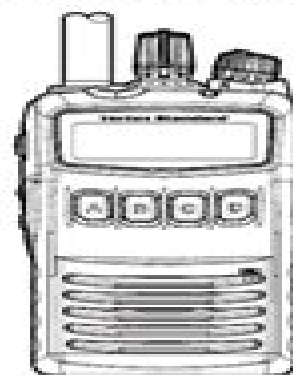
4 key Type