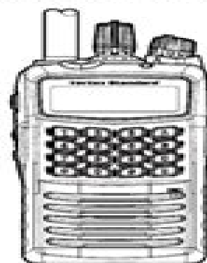
16 key Type

While we believe the information in this manual to be correct, VERTEX STANDARD assumes no liability for damage that may occur as a result of typographical or other errors that may be present. Your cooperation in pointing out any inconsistencies in the technical information would be appreciated.