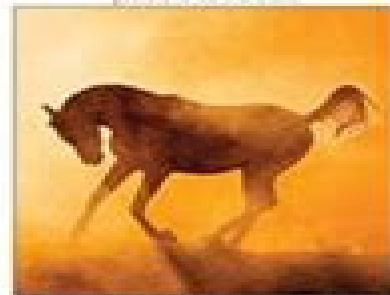
Whatever you do in life, try to enjoy the ride.