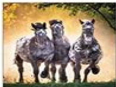
Give it all you've got.