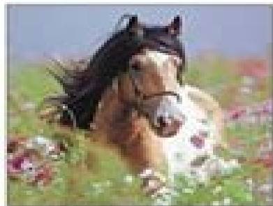
Take time to smell the flowers.