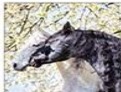
The most valuable thing you'll ever own is time.