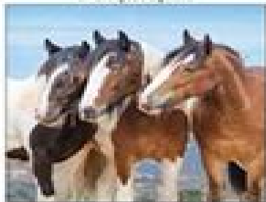
Stay close to your friends.