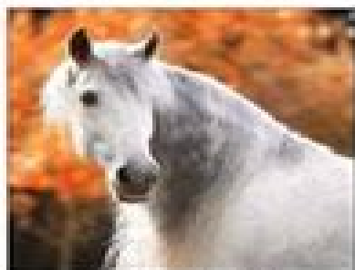
Stand out from the crowd.