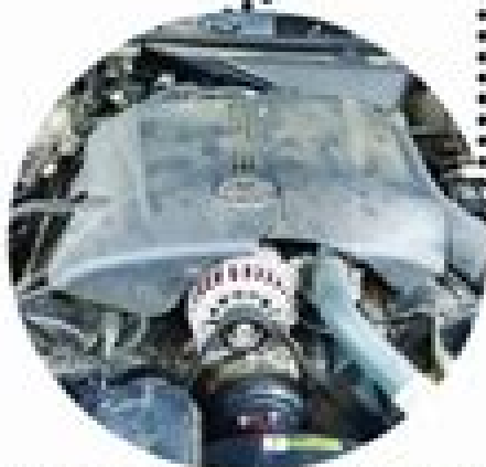
Issues with sensors found throughout the engine