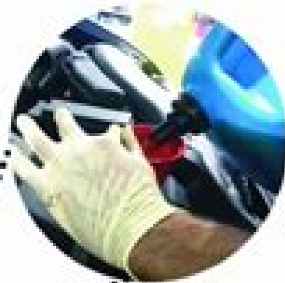
Low on oil