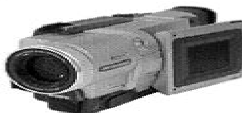
Photo : DCR-TRV730E RMT-814