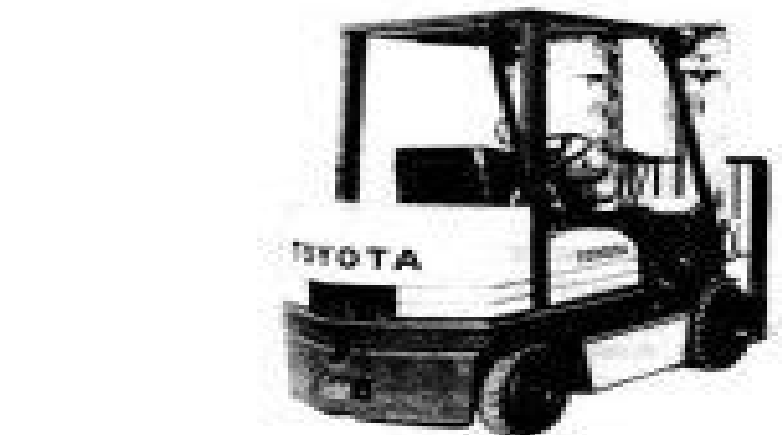
Vehicle Rear View