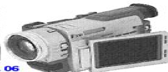
Photo: DCR-TRV900E RMT-811