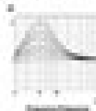
Low Level Frequency (LFF) Fréquence de réponse (LFF)