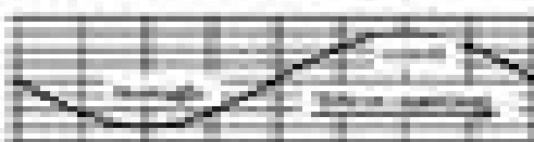
A standing wave.

Standing waves are created by interference between two waves, so we have both the wave and the trough at the same place at the same time. In reality, though, it's a mixture going up and down, just like a jump rope.