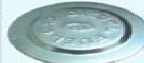
GW0776 NEW 78 mm SUPERSEDED BY: GW0161