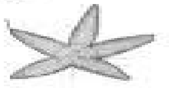
Figure 1: Illustration der Daten (siehe Tabelle 1) und der Ergebnisse der Analyse (siehe Tabelle 2).