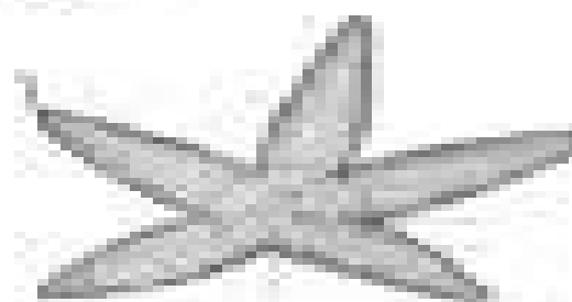
Figure 1: A hand-drawn sketch of a five-pointed starfish, showing its arms and central disk.

1. 4.2 2. 4.5 3. 4.8 4. 5.1 5. 5.4 6. 5.7 7. 6.0 8. 6.3 9. 6.6 10. 6.9