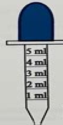
D. Oral Dropper

Answer the following questions 92 through 95 referring to the above devices.