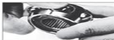
Suspension troubleshooting and repair, including procedures for disassembling and inspecting CV joints. Suspension and Steering, page 17.