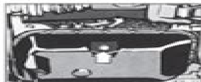
Perform routine maintenance, such as changing the engine oil and oil filter. Lubrication and Maintenance, page 10.

Though the do-it-yourself Volkswagen owner will find this manual indispensable as a source of detailed maintenance and repair information, the Volkswagen owner who has no intention of working on his or her car will find that reading and owning this manual will make it possible to discuss repairs more intelligently with a professional technician.