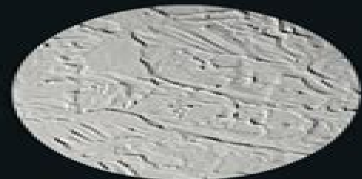
Slap Brush Knockdown