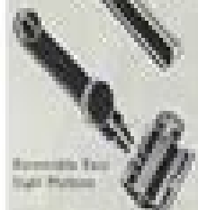
Removable Sight Protector