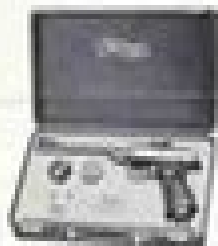
The PPK is carried in its own carrying case, which is built in the barrel of the pistol and the sight is built in the barrel of the pistol.

The first shot is the most difficult of all, and the most important. It is the first shot that the marksman must take, and it is the first shot that the marksman must take. The first shot is the most difficult of all, and the most important.