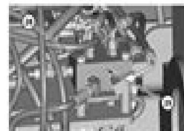
Diagram 7 g0007141