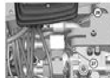
Diagram 8 g0007144