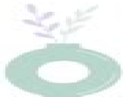
Hollow Circle Vase