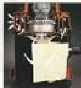
Shows close air flow when vacuuming.