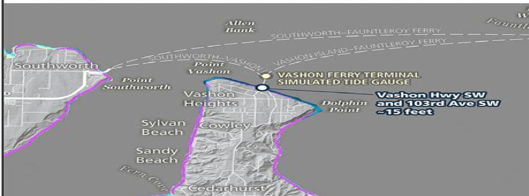
Tsunami Wave Height vs. Time: North End Ferry Terminal