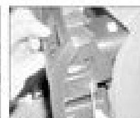
4.7b ... undo the heater retaining screws using sockets from the panel ...