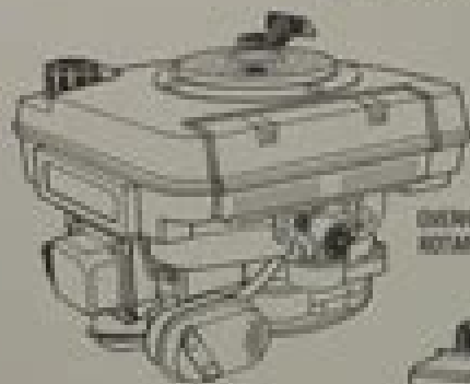
OVERHEAD VALVE ROTARY MOTOR