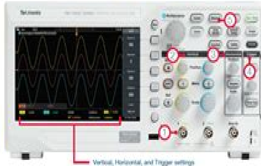
Vertical, Horizontal, and Trigger settings