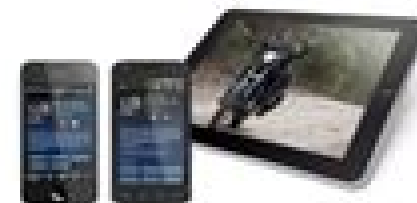
Stream to mobile devices