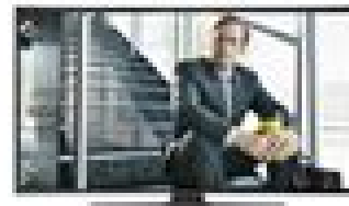
Bedroom #2: TiVo Roamio®