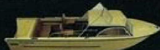
18' Starchief O.B. (and I.O.), page 9.