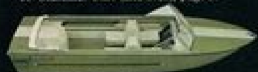
18' Holiday I.O. (and O.B.), page 10.