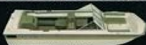
17' Capri I.O. (and O.B.), page 22.