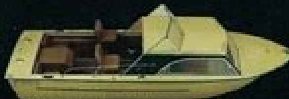
21' Chieftain I.O. (and O.B.), pages 6 & 7.