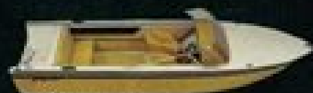
18' Nova, page 5.