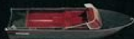
15' Nova, page 5.