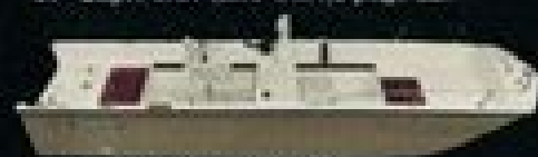
17' Capri Sport, page 22.