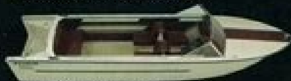
21' Holiday O.B. (and I.O.), page 11.