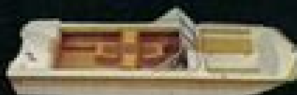
15' Capri, pages 21 & 23.