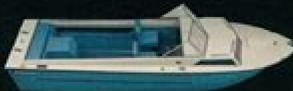
21' Islander, page 8.