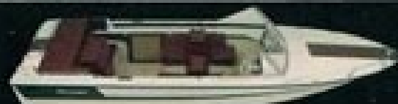
20' American, pages 24 & 25.