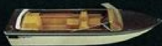
18' Nova I.O. (and O.B.), page 4.