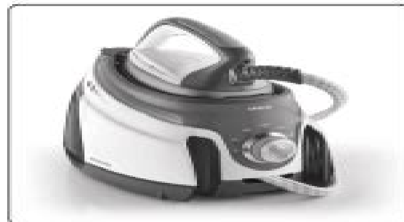
POLTI LA VAPORELLA XTXX - XT9XX - XH5XX

IT - Prima dell'utilizzo leggere attentamente le avvertenze di sicurezza | EN - Read the safety warnings carefully before use | FR - Lire attentivement les avertissements de sécurité avant utilisation | ES - Lea atentamente las advertencias de seguridad antes de usar | DE - Bitte lesen Sie vor der Anwendung die Sicherheitshinweise sorgfältig durch | PT - Leia atentamente as advertências de segurança antes de usar | NL - Lees de veiligheidsaanschuwingen zorgvuldig door voordat u ze gaat gebruiken | PL - Przed użyciem należy dokładnie zapoznać się z ostrzeżeniami dotyczącymi bezpieczeństwa | SE - Läs säkerhetsföreskrifterna noga före användningen.