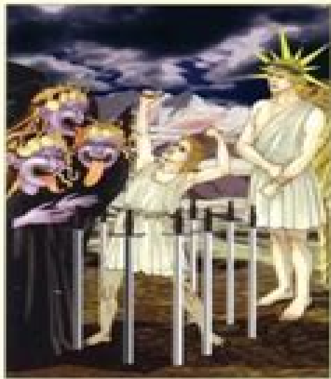
EIGHT OF SWORDS