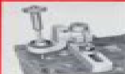
FIG. 1. The H. O. Lee valve guide reaming tool is designed to remove any metal excess which flows valve guides last in part of the cylinder head. These tools can be used to install oversize stem valves or replaceable valve guides.