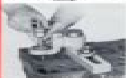
FIG. 2. The H. O. Lee valve guide reaming tool is designed to remove any metal excess which flows valve guides last in part of the cylinder head.