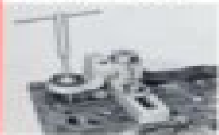
FIG. 3. The H. O. Lee valve guide reaming tool is designed to remove any metal excess which flows valve guides last in part of the cylinder head.