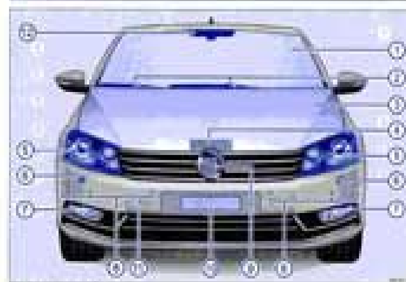
Вид 2. Вид автомобиля спереди