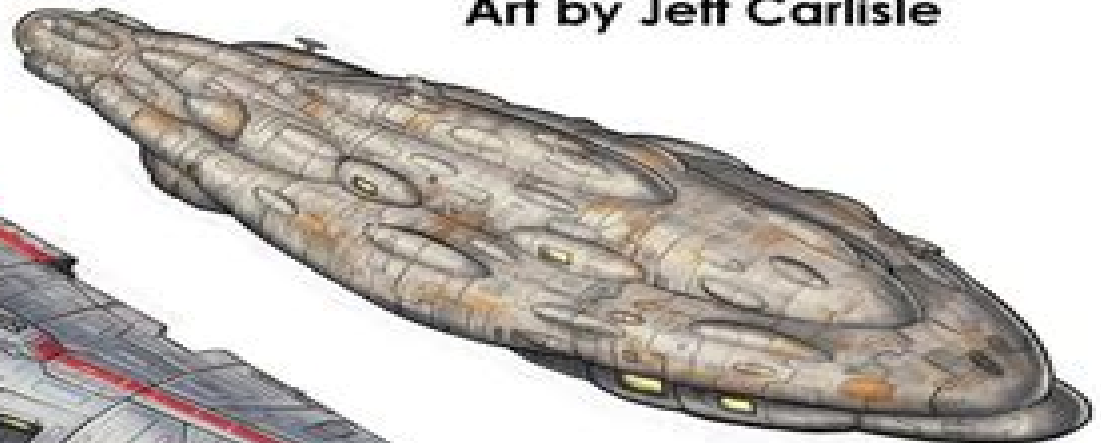
Mon Calamari Star Defender