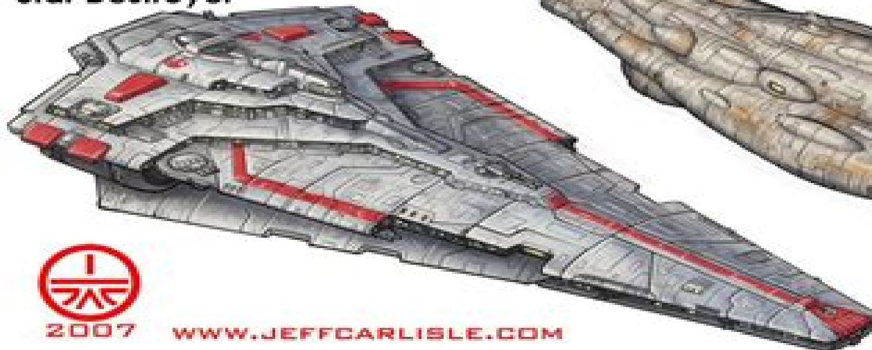
Nebula-Class Star Destroyer