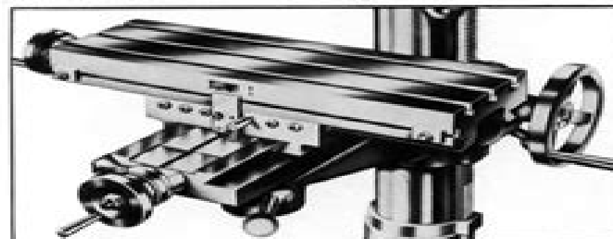
Universal Milling Table

Universal Milling Table for compound and Milling operations table 18" x 6". Cross feed 5 1/2". Longitudinal feed 11 1/2".