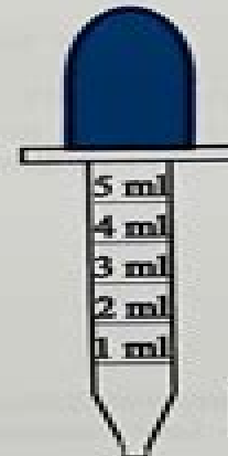
D. Oral Dropper

Answer the following questions 92 through 95 referring to the above devices.