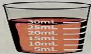
A. Medication Cup